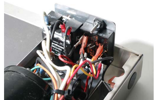
Figure 1: The kit is shown installed. The new air heat relay has a bigger footprint, necessitating the new bracket.